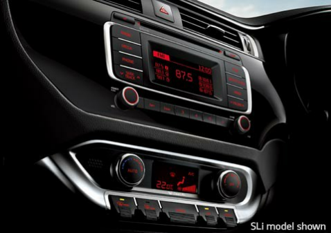
SLI model shown

While the ergonomically designed cockpit enhances driver comfort, the dashboard's intuitive design ensures an impressive array of technology and features are always within reach. The controls of the centre fascia are logically arranged for intuitive fingertip operation.