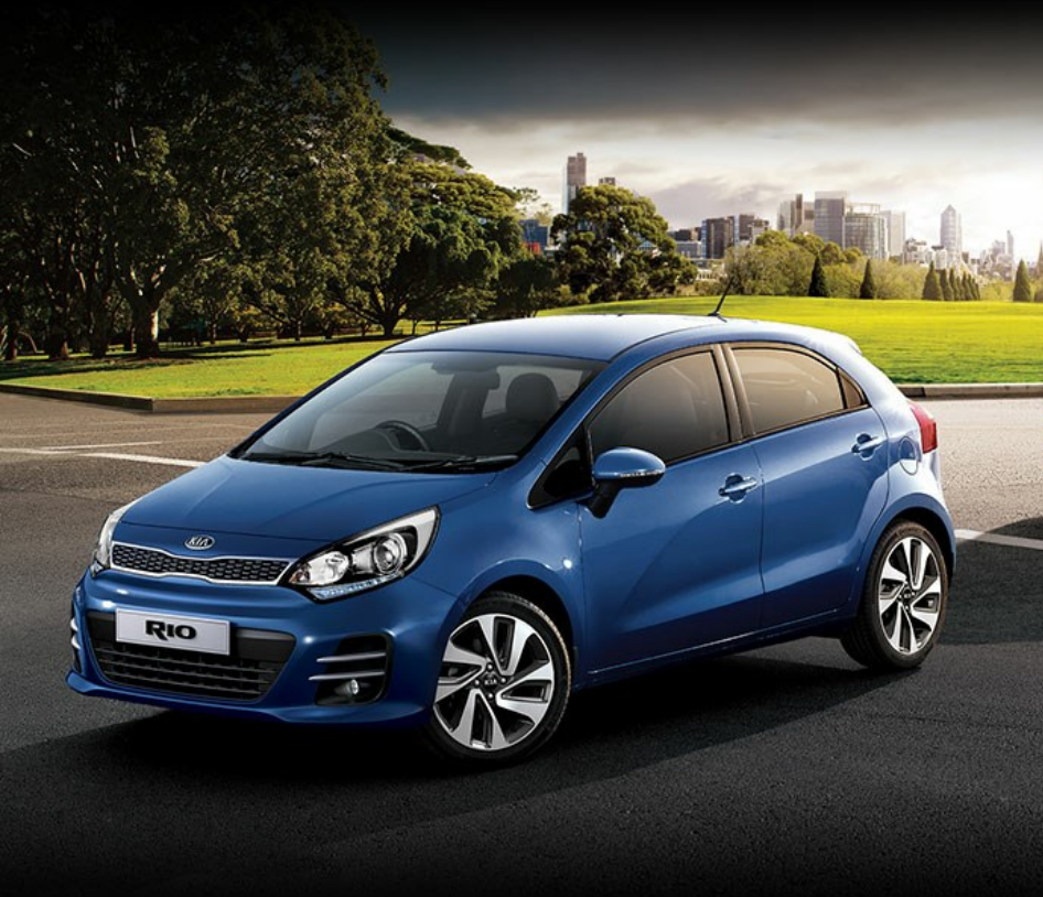
SLi model shown

Australians have always loved the Kia Rio. It's always been economical. It's always been reliable. It's always been safe, and it's always been stylish. Now, thanks to a coupé-like silhouette, Rio's clean, flowing lines combine style with the latest technology, advanced features and low emissions to create a small car you can be proud of.