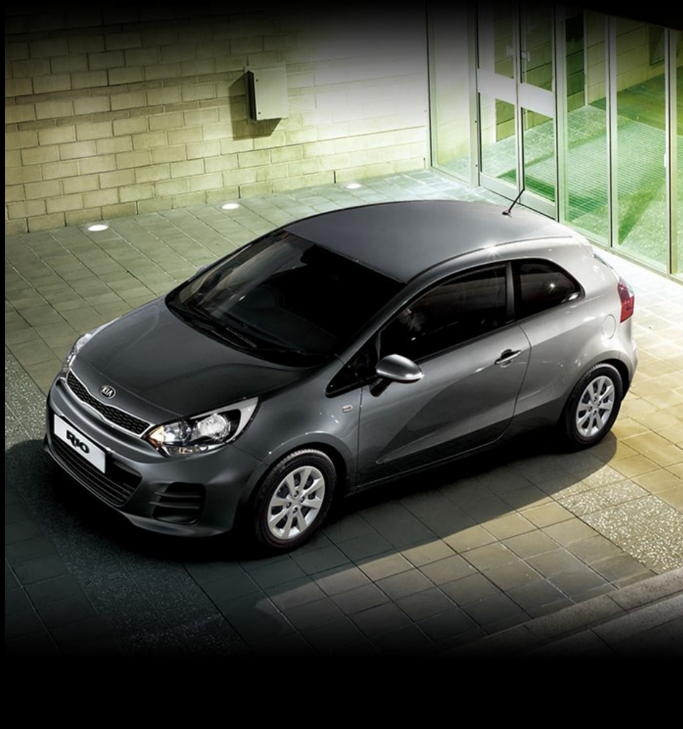
S model shown