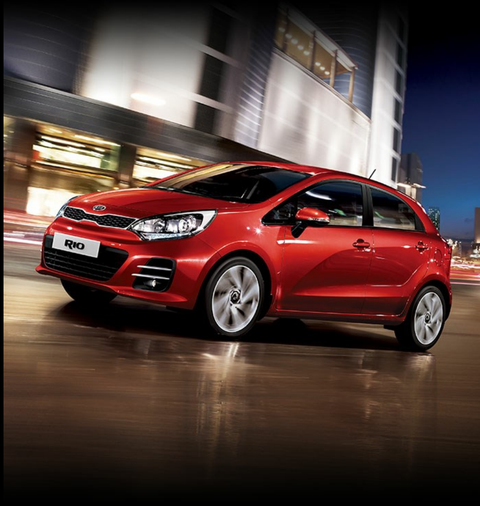
SLi model shown